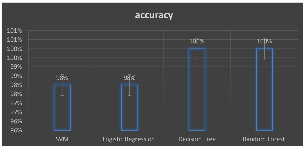
Fig.2. A comparasion Results

As shown in Figure 2 results of SVM, LR, DT, and RF and all achieved high precision, recall, F1-score, and accuracy of 98%,98%, 100%, 100% respectively. DT achieved perfect scores of 100% across all metrics, shows its ability to correctly identify cyber threats and minimize false positives and false negatives. The SVM and logistic regression classifiers also shows significant accuracy and consistency, demonstrating their superior performance in detecting cyber threats.