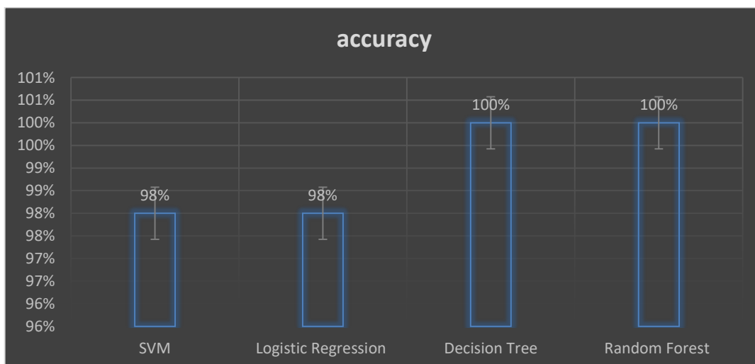
Fig.2. A comparasion Results

As shown in Figure 2 results of SVM, LR, DT, and RF and all achieved high precision, recall, F1-score, and accuracy of 98%,98%, 100%, 100% respectively. DT achieved perfect scores of 100% across all metrics, shows its ability to correctly identify cyber threats and minimize false positives and false negatives. The SVM and logistic regression classifiers also shows significant accuracy and consistency, demonstrating their superior performance in detecting cyber threats.