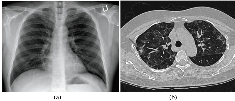
Fig. 1. (a) Example of chest X rays, (b) Example of CT-scan [11][12].

of artificial intelligence, and it is one of the parts and components of artificial intelligence. The next question is, what will we see when we search online for machine learning applications? our answer will be no comment on this question. we will not include it here, guys. You will explore and browse topics of interest to you using machine learning. Never lose your desire to learn new things. Guys, remember the famous quote by Obi-Wan Kenobi is a character in the Star Wars franchise, “May the Force be with you”, Learning and reading are the evidence of rising to the top—this advice by authors to all people trying to advance sciences.