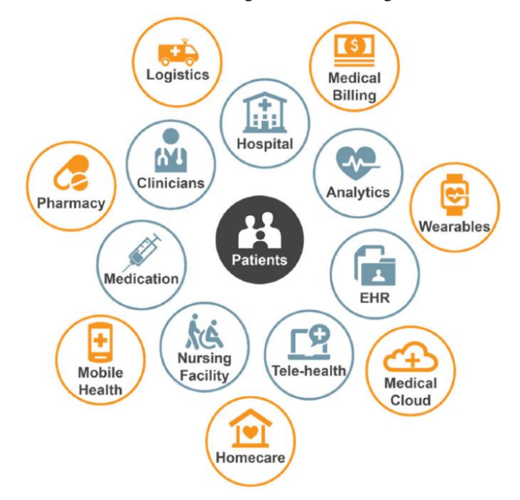
Fig. 2. The importance of healthcare and technology in serving humanity [23].

Managing datasets from the cloud is one of the desirable tasks implemented in healthcare institutions. It is essential and necessary for artificial intelligence, data processing, and information analysis. Unfortunately, healthcare organisations have limited datasets and need to be equipped to share them quickly because they use older-generation IT infrastructure rather than newer cloud-based systems. Even when they can combine data sets, because each person classifies their data in different ways, an AI system will only be as valuable as the data it relies on to learn from. Providing diagnosis and managing