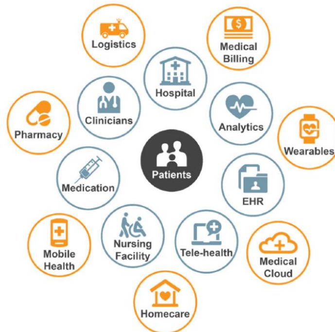
Fig. 2. The importance of healthcare and technology in serving humanity [23].

Managing datasets from the cloud is one of the desirable tasks implemented in healthcare institutions. It is essential and necessary for artificial intelligence, data processing, and information analysis. Unfortunately, healthcare organizations have limited datasets and need to be equipped to share them quickly because they use older-generation IT infrastructure rather than newer cloud-based systems. Even when they can combine data sets, because each person classifies their data in different ways, an AI system will only be as valuable as the data it relies on to learn from. Providing diagnosis and managing