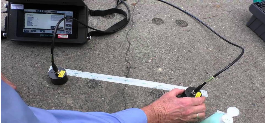
Fig. 2. Types of Concrete Cracks and Their Causes [16]